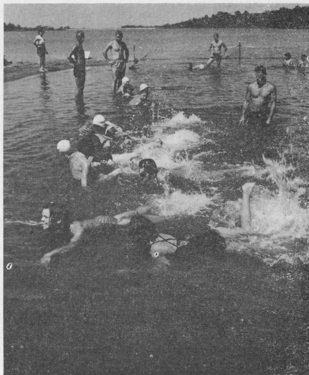
Little Grassy Lake resounded with great splashings and shouts of childish glee this summer as boys and girls sponsored by welfare and crippled children's groups came to camp. A part of SIU's outdoor camping program, Little Grassy was also open to Southern Illinois elementary and high school students.